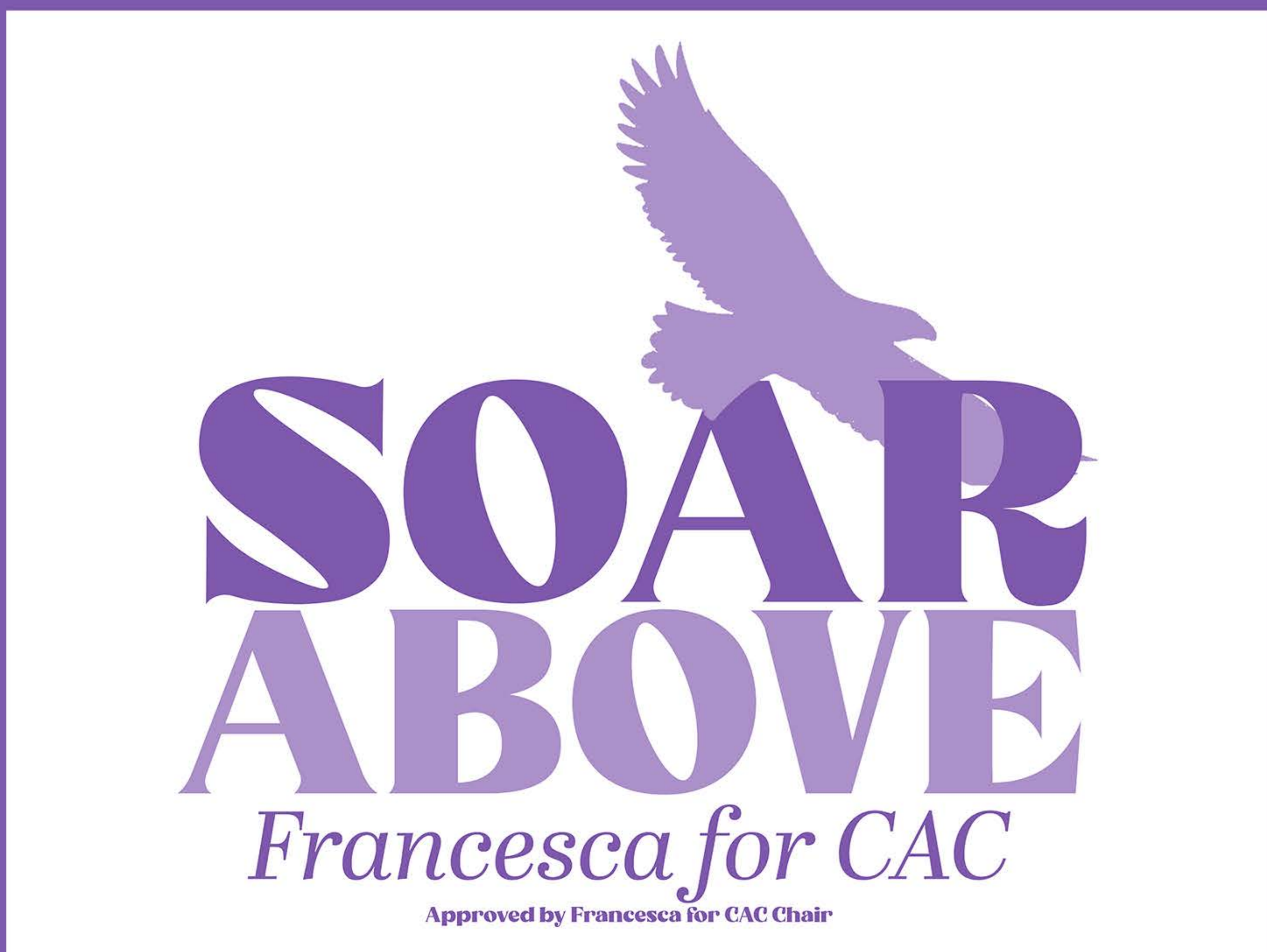
YARD SIGN DESIGN